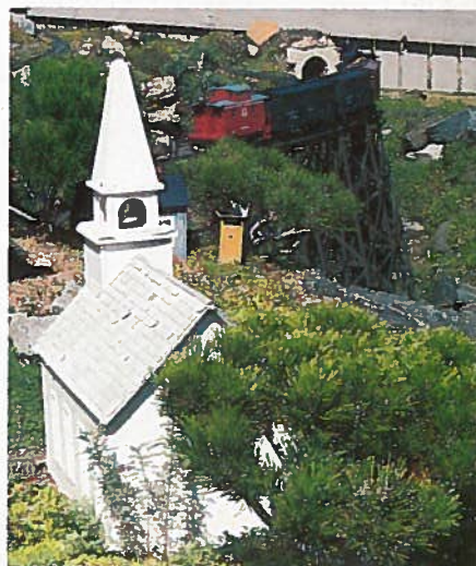
What makes a railway great? page 38