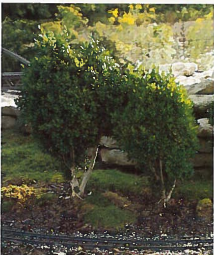
Get boxed in with boxwoods, page 74