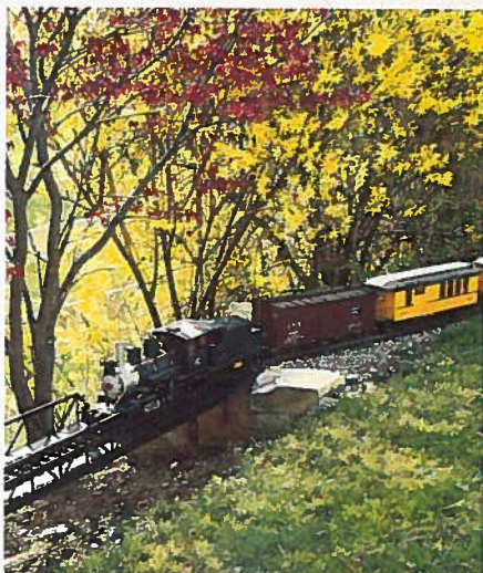
American touch in Switzerland, page 56