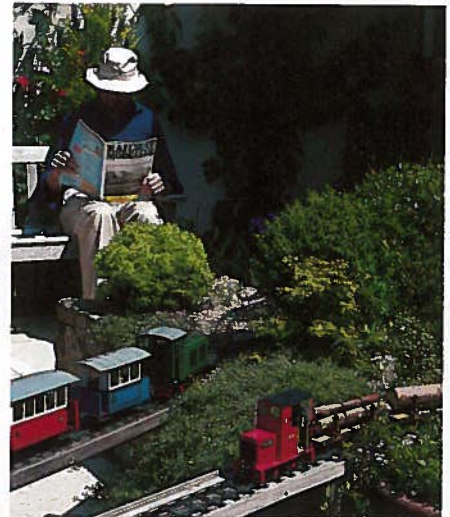
What makes a railway great? page 42

Cover photo: A scratchbuilt trestle on the Connecticut Central Railroad skirts the pond where water lettuce floats. White-flowered sweet alyssum adds fragrance and color to this semi-shady spot. See the story on page 58.