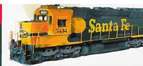
Detailing Aristo-Craft's SD45 diesel