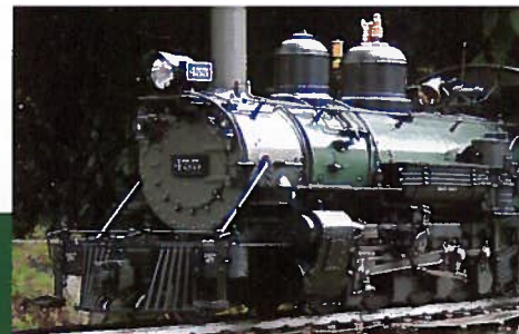
BACHMANN'S NEW K-27: 1 of 3 locomotives reviewed

How to repaint a locomotive Make Victorian details for structures