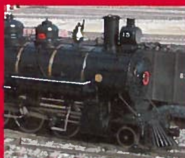
RYM EBT 2-8-2