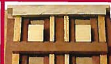
FLATCAR JIG — P. 44