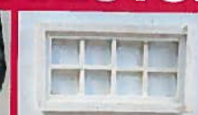
DOORS/WINDOWS — P. 65