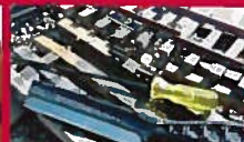
LAY FLEX TRACK — P. 46