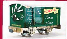
TINPLATE BASICS — P. 30

SPECIAL FALL HOW-TO ISSUE 7 GREAT PROJECTS!