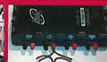
MTH BATTERY DCS — P. 60