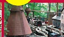
WOOD BURNER — P. 55