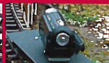
PANNING CAMCAR — P. 50