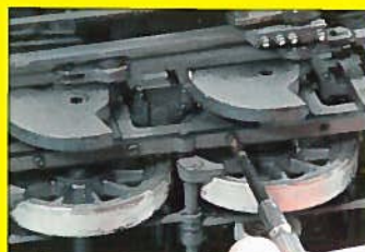
Replace broken gears