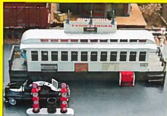
Kitbash a retro diner