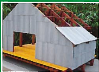
Make corrugated metal from soda cans p. 34