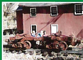
Rescale a Bachmann log car p. 28