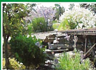
Use sedums as an easy-care groundcover p. 20